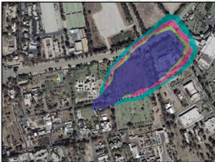
Figure 2. Example of Persistent Chemical Plume Dispersion

The REM utilizes simulated plume data generated for the appropriate threat scenario to estimate the exposure of personnel based on their location relative to the plume (Figure 2) and incorporates how they would respond to the incident. This response includes the time it takes the installation to detect the threat, warn its respective populations, take protective action and begin treatment. This